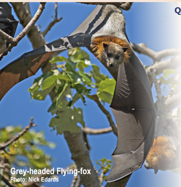
Grey-headed Flying-fox